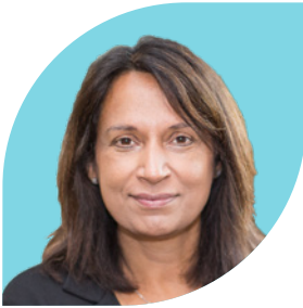
Baroness Ruby McGregor-Smith CBE