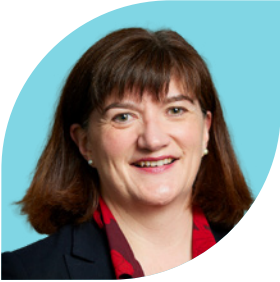
The Rt Hon Baroness Nicky Morgan

At every stage of the journey, from pre-school to retirement, we are gaining valuable knowledge, skills and experience that are essential to life. Lifelong learning opens up new opportunities, helps create more personal fulfilment, and enables us to play our part in a thriving economy.